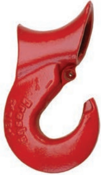
A-350N SLIDING CHOKER HOOK